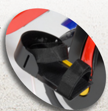
AM-9 footplate detail

Snappy Seat, Forward Extender Plate, 2 ½ inch crank arms, Hand Strap, Wrist Wraps, Wrist Brace Holding Mitts, Vertical Hand Grips, Brachial Plexus Kit, Foot Cups, Pedal Blocks, AM-9 Pedal Leveler, Knee Adductor Positioning Strap