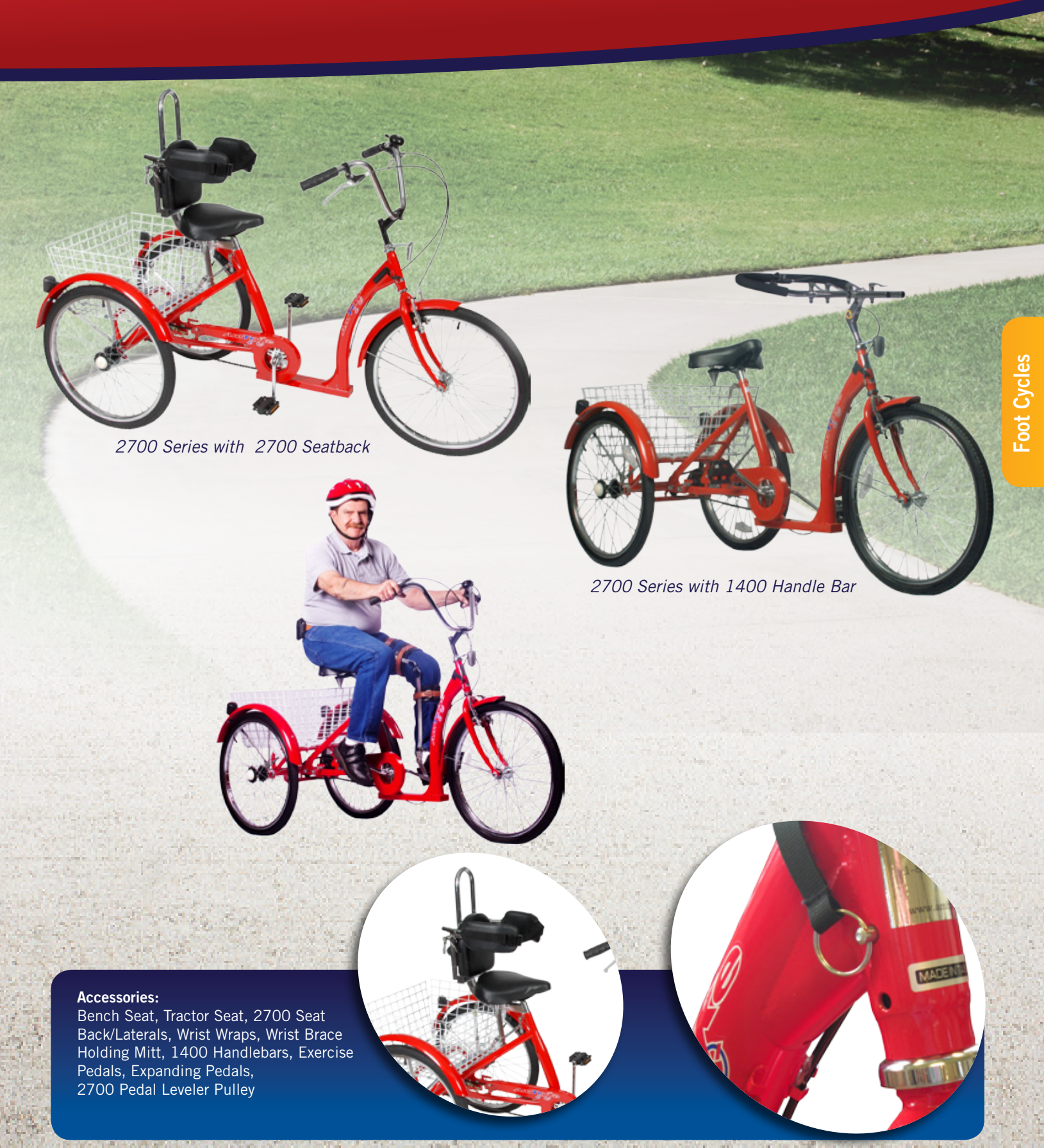
2700 Series with 2700 Seat Back/Laterals