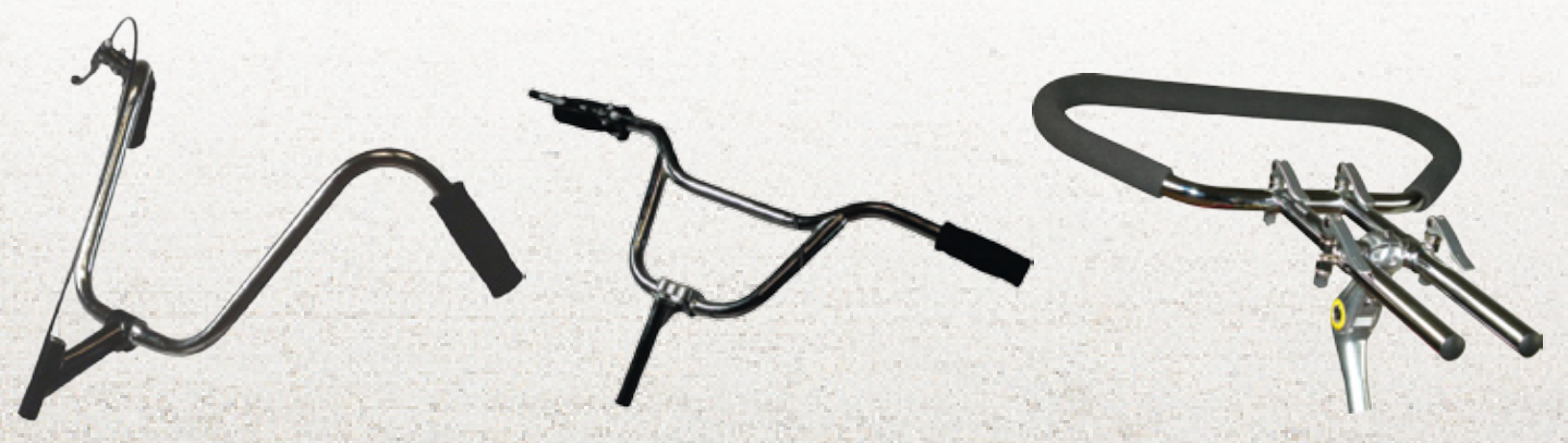
Hi Rise Handlebars